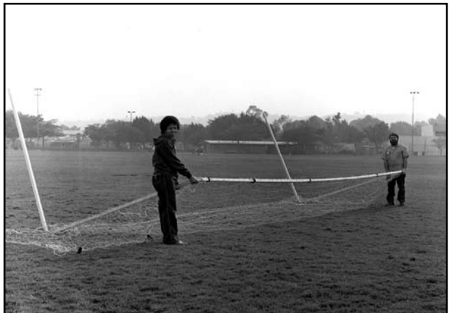
4. Rotate goal to upright position.