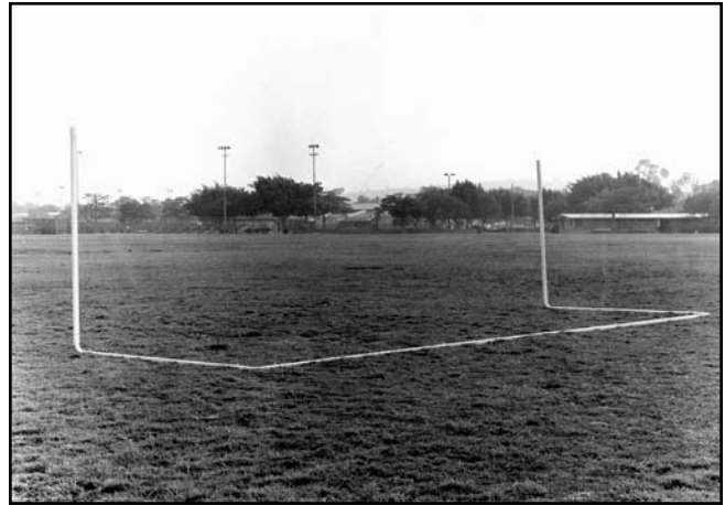
2. Slide pieces together.