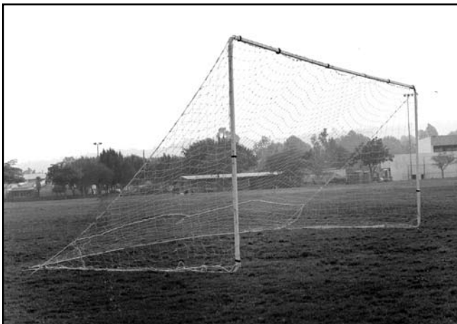
5. Fasten net on bottom.