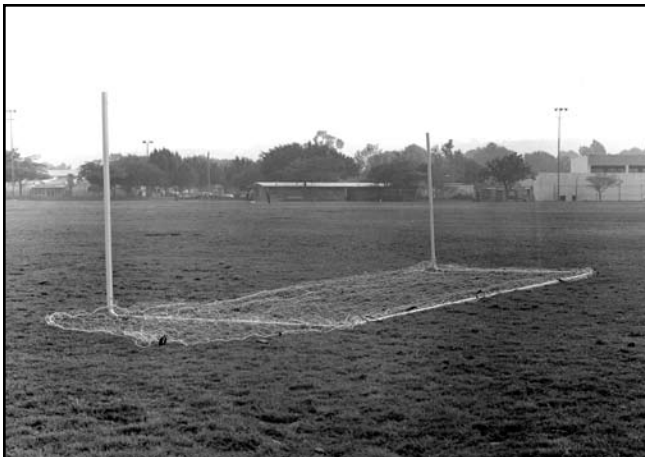
3. Attach net to top of goal.